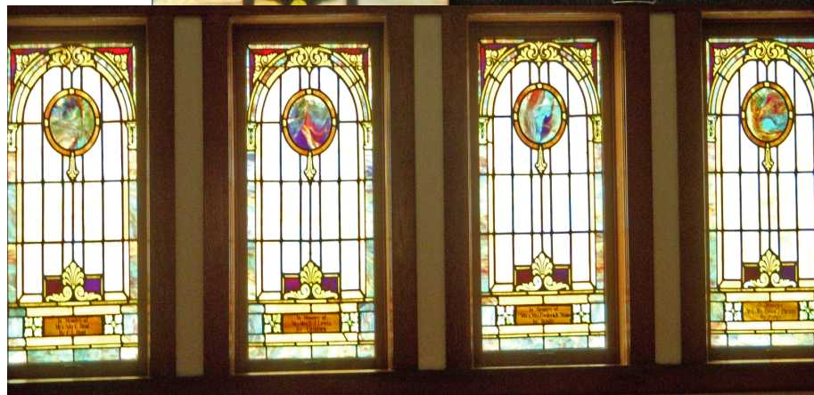
the stained glass windows featured throughout United Methodist Church, Ripley.